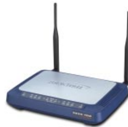
Providing security for an office network's wireless devices is a wireless appliance, the SOHO TZW from SonicWall, a Best of Comdex winner in "Wireless Infrastructure."

and wireless phosphor-plate sensors. The radiography program then could send the image to another completely different program, and the x-ray image could be viewed or enhanced using the second program. Interoperability comes from vendors working together using shared standards, such as the Digital Imaging and Communica-